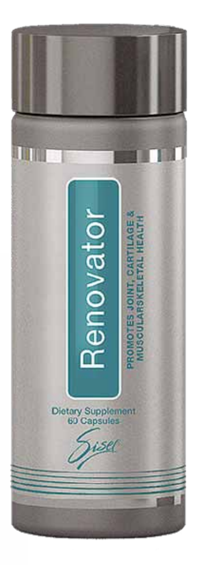
Get Support for Your Joints, Cartilage and Musculoskeletal System